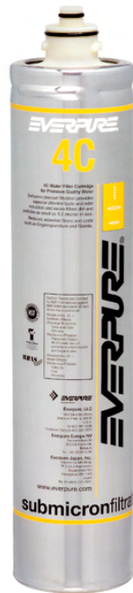
4C Replacement Cartridge: EV9600-00 (1-pack) EV9601-00 (6-pack)

Delivers premium quality water for cold cup vending applications